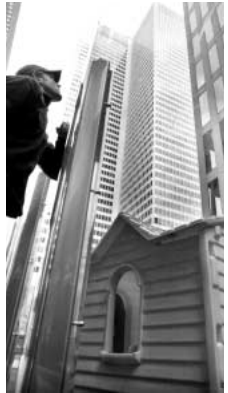
Tower above: The Royal Bank Building at Place Ville Marie in Montreal.